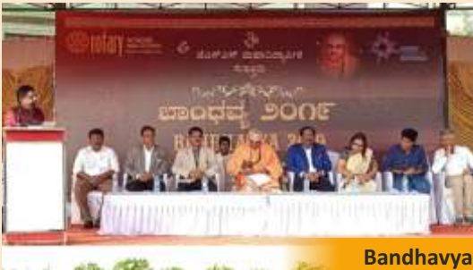
Bandhavya 2019 at Suttur